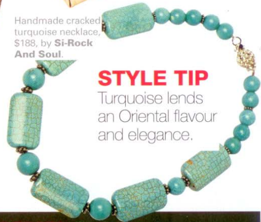
Handmade cracked turquoise necklace, $188, by Si-Rock And Soul .