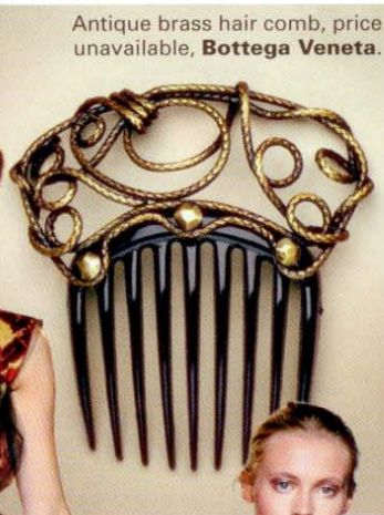
Antique brass hair comb, price unavailable, Bottega Veneta .