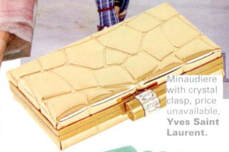
Minaudiere with crystal clasp, price unavailable, Yves Saint Laurent .