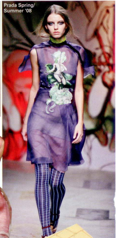
Prada Spring/Summer '08