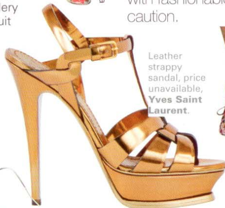
Leather strappy sandal, price unavailable, Yves Saint Laurent .

Clashing colours and prints are to be attempted with fashionable caution.